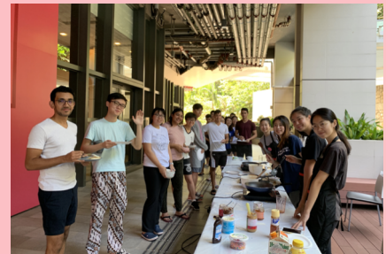
pancake morning for residents hosted by LCCA

Join us in building Lap-Chee spirit with our fellow team members in college!